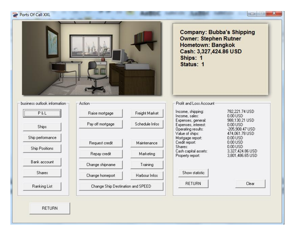
Figure 4 – PoC Reporting System Overview Page