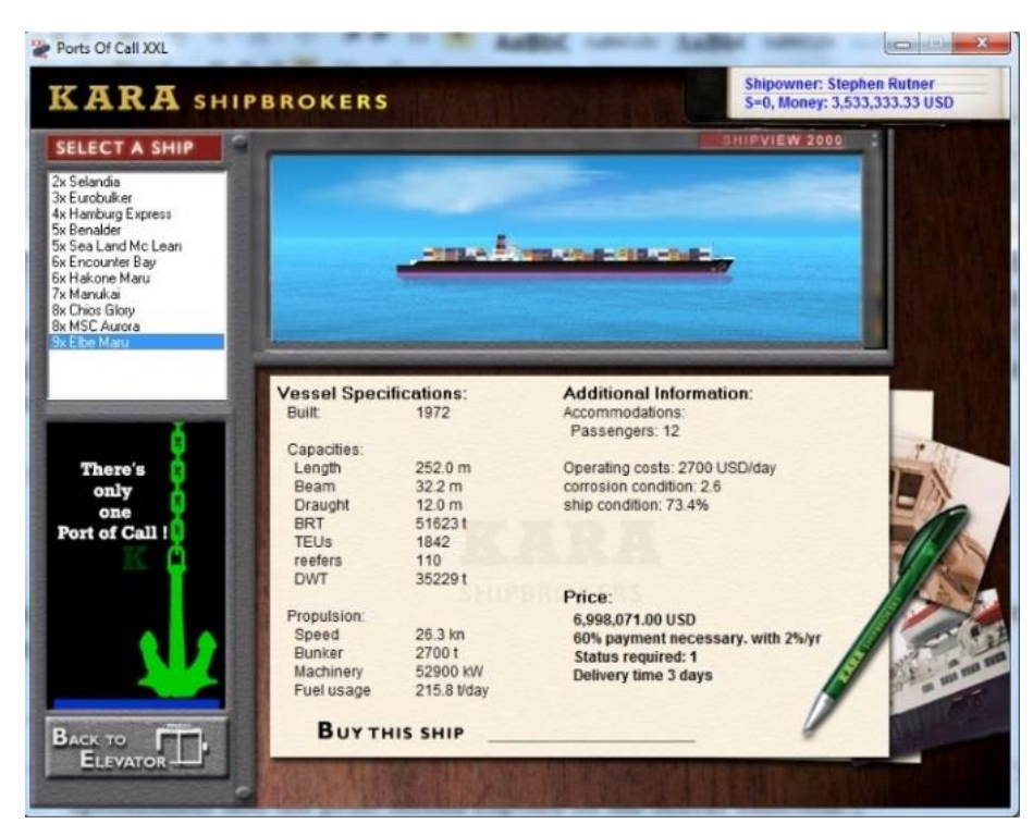
Figure 2 – Example Container Ship for Purchase (other container classes listed in "select ship menu")