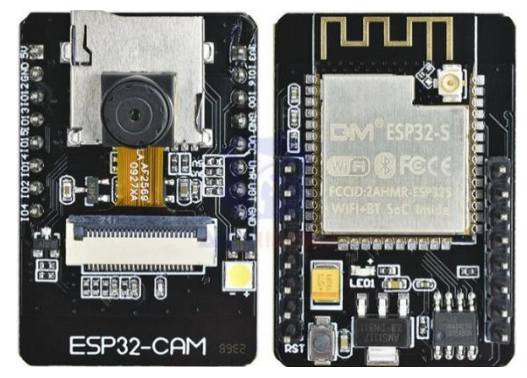
Figure 2: ESP32-CAM Board (Front & Back Views)

will be given to the user; if not, access will be denied.