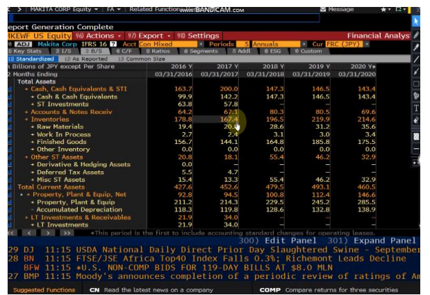
Figure 3. Download the balance sheet and income statement for that company for the most recent 3 years.