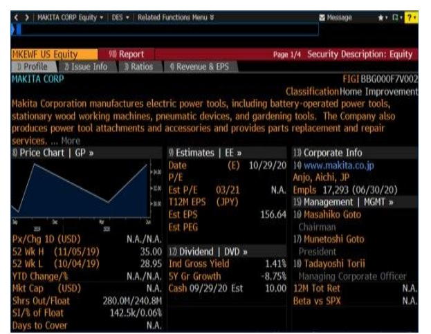
Figure 2. Investigate the different types of data that Bloomberg has on that company.