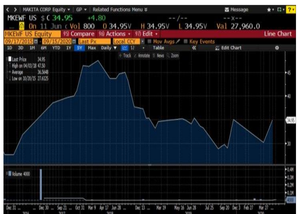
Figure 4. Use the general plot function GP to plot stock price using 3 years of daily data.