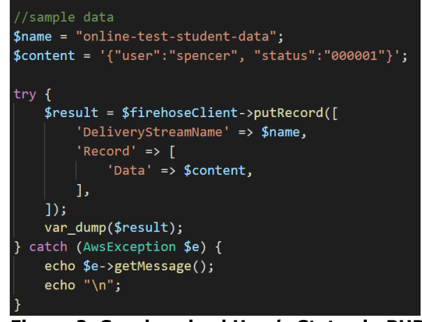
Figure 2: Synchronized User's Status in PHP

Data latency is critical for the synchronized exam; this paper compares the data latency performance under different architectures. The start timestamp is recorded when the data is being sent out on the client-side, and the stopped timestamp is generated on the server-side to calculate the data latency between the front and backend.