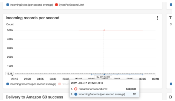
Figure 6: Data digest in a second.

This section presents the data collection from AWS Kinesis and Moodle system. The data is generated from AWS Kinesis API with a message buffer size of 1 MB, and each Buffer interval is 60 seconds. The idea for deciding on the buffer size is based on the size of all the questions in the online exam. We evaluate the amount of data generated from the student; each tested student has around 50 questions, and each question takes 2 bytes, which equals 0.000002MB. Therefore, one student can send 0.0001MB of data to the AWS Kinesis server for an online test. Based on the architecture purpose of this paper, Figure 6 shows that our approach can handle around 500,000 students taking the online exam simultaneously. The X-axis is the time period, and the Y-axis is the number of records our architecture can support.