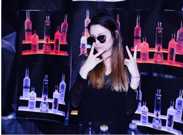
Figure 2 Casino Bar