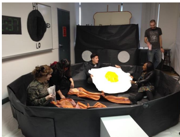
Figure 1 Kitchen Counter

In the past three years, we have run this project each spring. Over that time period, art students produced 18 "5 Senses" installations, six each year (one per team). Themes ranged from a kitchen counter in which students sat in a giant frying pan with giant bacon and eggs smelling breakfast smells (Figure 1) to a casino with fake bar (Figure 2) to a "scary" space with broken glass under a fake floor (Figure 3). Other notable themes included a crashing airplane, a hippy hangout, a 4 th of July cookout, a snail shell, purple, the Vietnam War, etc. They were very creative and unlimited as long as they met the basic guidelines.