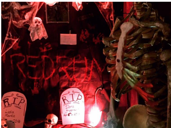
Figure 3 Scary Space