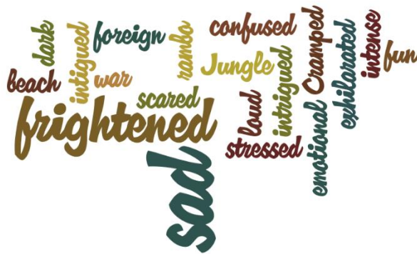
Figure 5 "Vietnam War" word cloud

The PANAS X data were analyzed using the formal methods stipulated by the instrument. The results were then presented in tables mapped back to the individual spaces. In Table 1, you can see the summarized results from our second year (the same year that included the Vietnam War and Saloon installations so that you can compare the results for reliability and differences). In this summary table the percentage of negative and positive dynamics from PANAS X that significantly showed up in the survey data were indicated. For example, the Scary Room space responses all had an average of over 1.25 (indicating that most respondents found those dynamics present at some level e.g. our significance indicator) on each of the 6 negative affect scales (thus 100% negative). Clear patterns of positive and negative affect do show up. Additionally, the