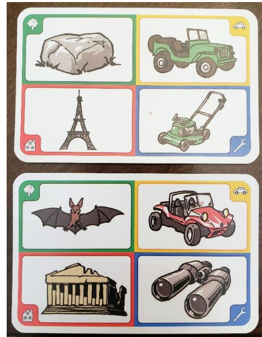
Figure 2: Sample Lego Creatory Cards