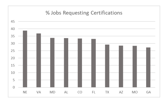
Figure 3. States with the Highest Percentage of Jobs Requesting Certification