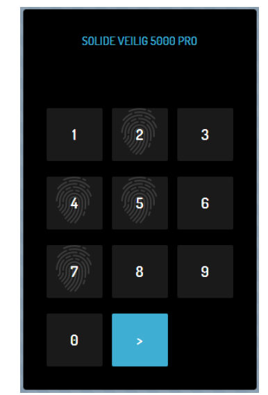
Figure 5 – CyberStart Go medium challenge

The game, called CyberStart Go, features 12 introductory problem-solving challenges (5 easy, 6 medium, 1 hard) related to subjects like cryptography, forensics, and Linux. For example, one of the medium challenges categorized under cryptography displayed the electronic keypad in Figure 5 and asked players to help determine the four-digit PIN using the fingerprints as a clue. Readers curious about the game can peruse it here: <u>https://go.joincyberstart.com/</u>.