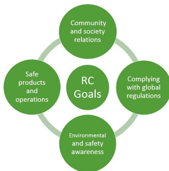
Figure 1: Goals of Responsible Care Association ( https://slideshare.net/kaushalsutaria/rcms-rc-14001 )

In an effort to maintain their industry leading position, SAPCO began to research ways in which they could differentiate themselves from other organizations in the market. They were approached by the Responsible Care Association (RC), a United States based safety organization overseen by the American Chemistry Council (ACC). The goals of the Responsible Care Association can be seen in Figure 1.