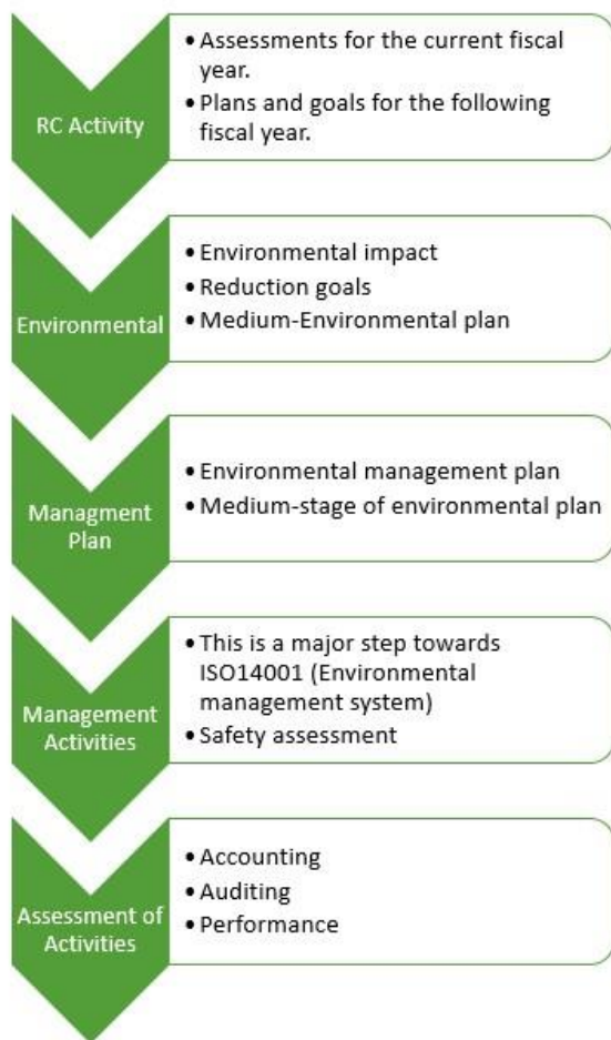
Figure 2: Responsible Care Implementation Process( https://responsiblecare.americanchemistry.com/Responsible-Care-Program-Elements/Management-System-and-Certification )

The Responsible Care Organization audits and trains petrochemical companies on how to handle their products in a way that reduces the number of safety incidences, while simultaneously increasing efficiency. Prior to training, all segments of the company go through a vigorous safety and quality audit and all issues uncovered during the audit must be remedied. RC requirements were extended to cover contracts handled by third party vendors, and now require comprehensive audits of their facilities. The method for handling contracts under RC differs greatly from SAPCO's current practices.