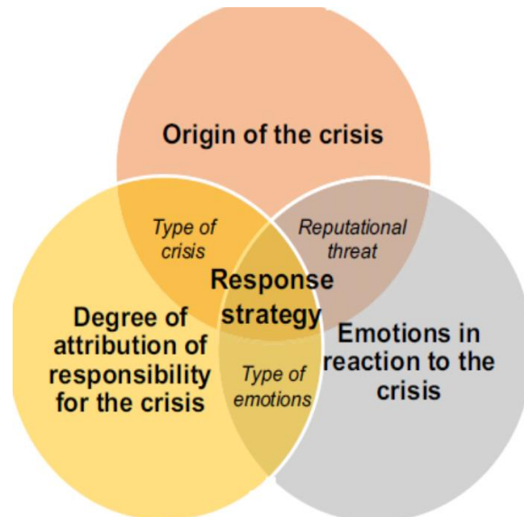
Figure 1 – Integrated Crisis Management Strategy (Vignal Lambret & Barki, 2018)

Jin & Liu's (2010) SMCC model and framework can then be applied tactically to help further assess potential gaps, issues, and opportunities in Southwest's crisis communication strategy. See Figure 3 in the Appendix for an overview of that approach.