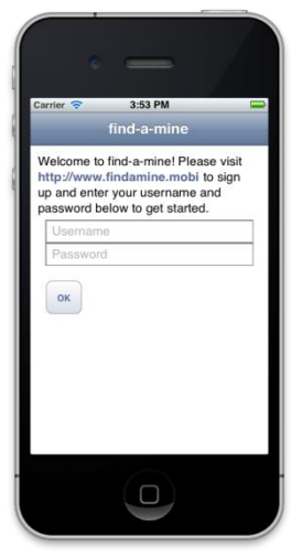
Figure 1 Login screen

On the surface, Find-a-mine is a mobile scavenger hunt game. Participants sign up on the game's web site (http://www.findamine.mobi) which explains the research nature of the application, what data will be tracked, and acts as a hub for users to manage their accounts and interact with other players. Currently, we are only recruiting university students to take part; however in the future, we believe this game can be expanded to the general public. To incentivize students to participate, gift cards are available to those who successfully complete the hunt. Winners are those who score the most points. Points can be award in a variety of ways including solving the most hunts or solving the hunts the fastest. After signing up, the participant logs in with the iPhone application to start the scavenger hunt. Figure 1 illustrates the login screen.