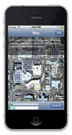
Figure 2 Playing the game

treasure. To accomplish the privacy research goals, the player's location is tracked throughout the entire game and the player is required to answer a set of research questions after each clue. Figure 3 shows what the research questions view looks like to the participant.