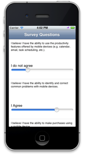
Figure 3 Research Questions View

Location data, the photo of the treasure, and research question answers all need to be accessible by the researchers in near real-time. In addition, the participants require access to the latest clues, available games, and leaderboard. Our design consisted of a three-tier architecture using a variety of different technologies as illustrated above by Figure 4. The iPhone application was developed using Objective-C and the XCode IDE. This is the