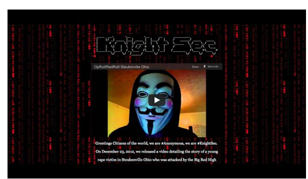
Operation RollRedRoll Website Defacement

"This is a warning shot to the school faculty, the parents of those involved and those involved especially. A preliminary 'dox' is being released on some of those involved, while a full size dox of everyone involved including names, social security numbers, addresses, relatives and phone numbers is being complied as you watch this video, of every single member of the football team, whose involved, the coaches, the principal and more. These docs will be released Media attention escalates as the story takes on a life of its own. @KYAnonymous is seen more