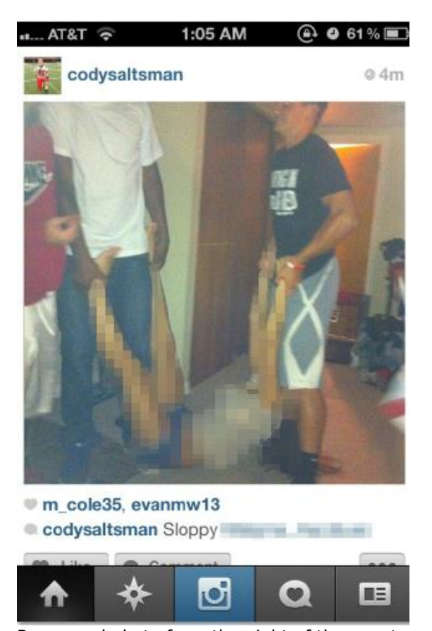
Recovered photo from the night of the events