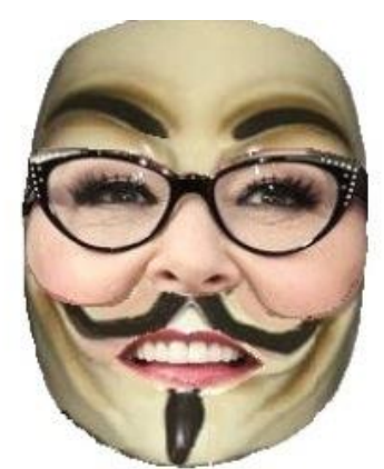
Roseanne Barr's Twitter profile picture after Occupy Steubenville protest