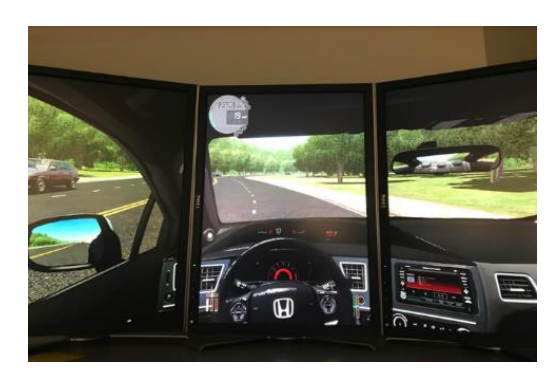
Figure 1. Driving Simulator

Before the experiment, a pilot test was conducted to detect potential issues in the experiment design with six subjects. Based on the feedback from the pilot test, the researchers revised the experiment's design in terms of session time, driving difficulty, driving environment (e.g., town or highway), weather, vehicle types (e.g., sedan or SUV), and traffic conditions. The experiment is composed of five sessions with the four mobile distractions (i.e., stimulus) in the hypotheses and without distractions in order to measure the impact of mobile distractions on driving performance. Each session took approximately 60 minutes to complete. The driving environment was set to a highway environment with moderate traffic entering the highway, but where few external distractions existed. This allowed the researchers to measure the impact of mobile distractions on driving performance, excluding the other distractions.