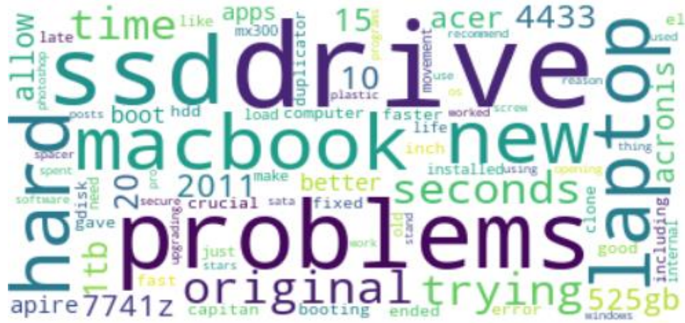
Figure 6. Chosen Set of Reviews Word Cloud