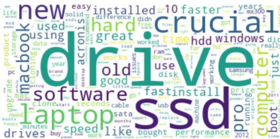
Figure 5. SSD Corpus Word Cloud