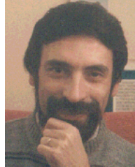
Anany Levitin Department of Computing Sciences Villanova University Villanova, PA 19085 USA

A new undergraduate program in Information Science is described. The program addresses the need for graduates prepared to specialize in the use of computerized information. This is a unique program. It is a technically challenging program that builds on a strong foundation in computing and looks at information as a serious topic of study in its own right. The program shares its first three semesters with a Computer Science (CS) degree program; however it includes five required courses that are not required of the CS majors and boasts a different, albeit overlapping, set of elective courses. The program promises to be exceptionally strong in its coverage of Web related topics and information theory.