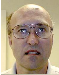
James W. Denton College of Business and Economics West Virginia University Morgantown, WV 25606 USA