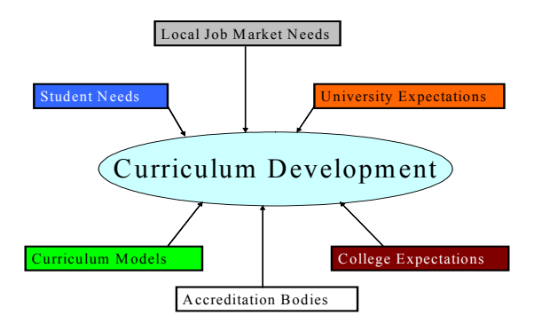
Figure 1: Inputs into Curriculum Development

Current approaches to curriculum development typically revolve around curriculum committees. A department's curriculum committee typically begins the process by considering input from a number of sources as shown in Figure 1.