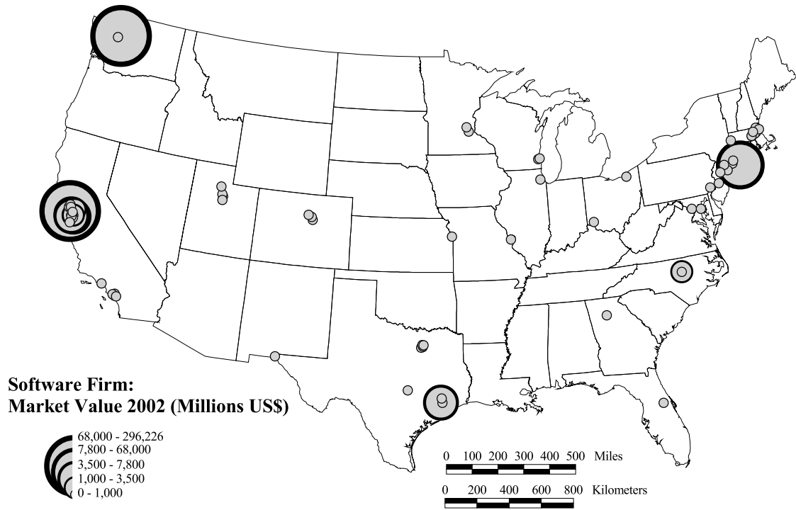
Figure 3. The Spatial Distribution of the Stock Market Value of the Software Companies in 2002