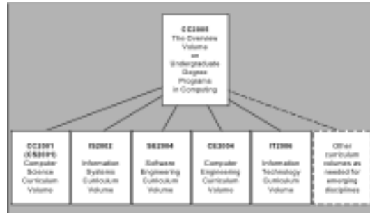
Figure 1 - Computing Curricula Guidelines

As the report declares “We have created this report to explain the character of the various undergraduate degree programs in computing and to help you determine which of the programs are most suited to particular goals and circumstances.” (Shackelford et. al., 2005)