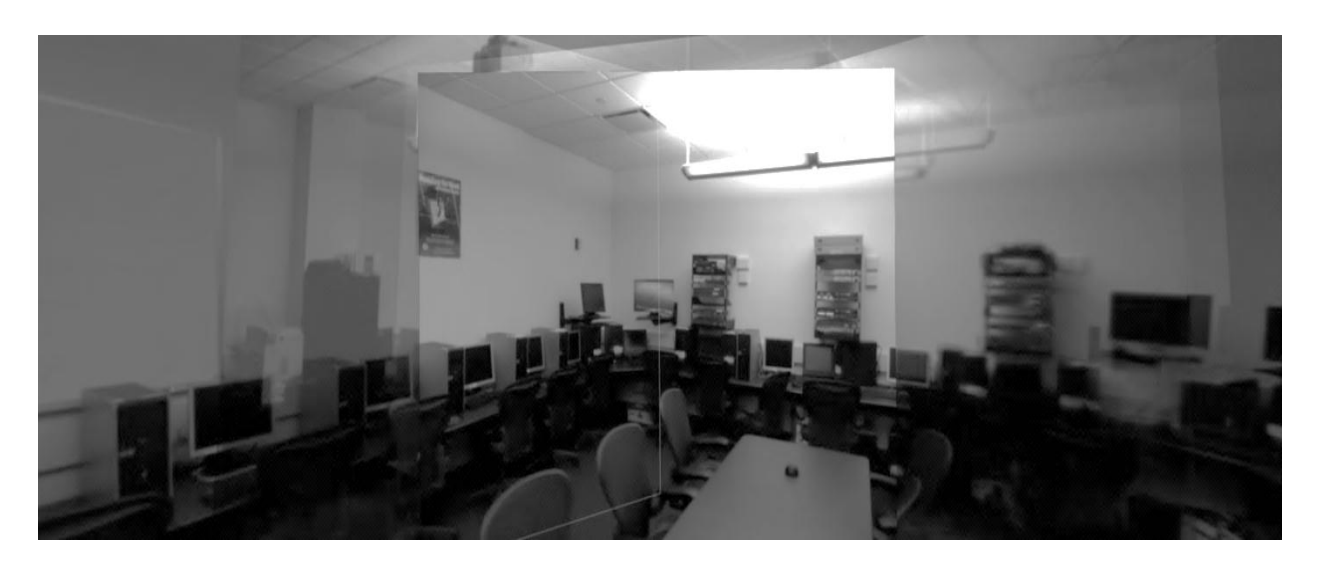
Figure 1. The CIS Lab, prior to renovation.