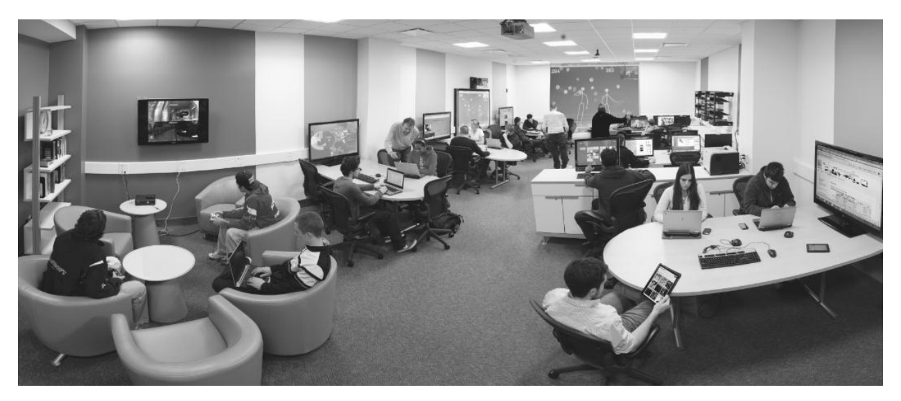
Figure 2. The renovated CIS Learning and Technology Sandbox.