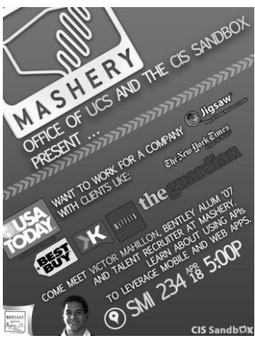
Figure 1. Students create posters and flyers for special events in the CIS Sandbox.

To enable student workers to take on these creative projects, and following an employment model at Google, (Mediratta & Bick, 2007) those who take on expanded roles are given one hour per week apart from their scheduled tutoring responsibilities to work on planning specialized activities in the CIS Sandbox.