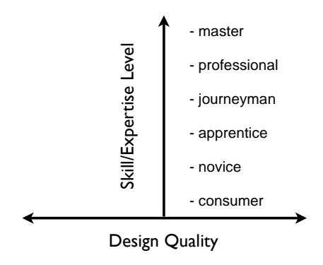
Figure 2. Design Quality's Relationship With Skill/Expertise Level

We propose two dimensions of design competency in order to explore design-centric IS pedagogy: 1) the breadth of design quality addressed and 2) the depth of skill/expertise in realizing these qualities in artifact design. The skill/expertise dimension represents an accumulation of knowledge, but also implies an aspect of "absorption" to indicate what might be a reasonable expectation for a particular "learner."